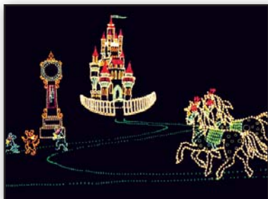
See your favorite displays and be the first to see the new displays!