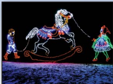
Festival of Lights Goes GREEN with vibrant, energy-saving LED lights!

Join in the celebration of the show's silver anniversary and see for yourself why so many visitors return year after year to this special holiday light festival.